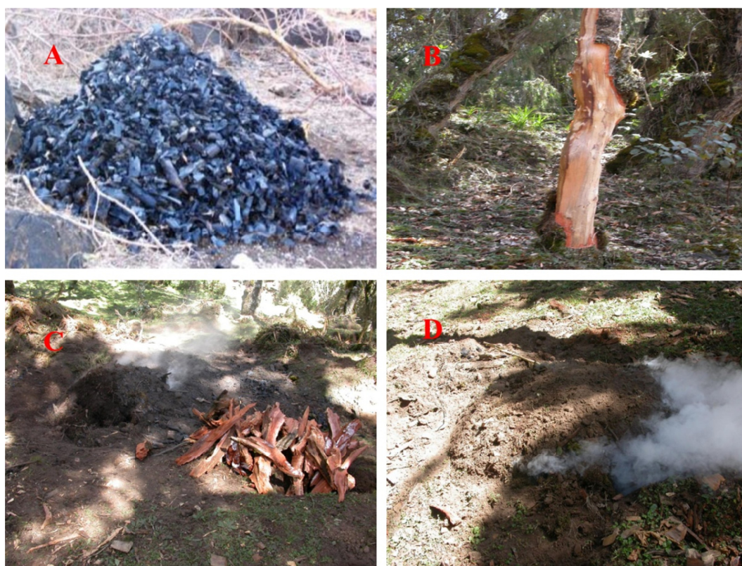
Figure 2. Illegal charcoal production in A) Awash National park, source Yohannes et al. (2011), (B-D) in Bale Mountains National Park from Myrsine melanophloeos (ex Rapanea melanophloeos at ca 3200 m) Photo by Maria Johansson

People use charcoal due to the fact that it is a cheap commodity that requires low priced, affordable and readily available metal or ceramic stoves in the market as compared to electric and gas stoves for cooking purpose (Luoga et al., 2000). Besides its uses, currently, charcoal production is causing a threat in conservation and management of national parks in Ethiopia (Chanie & Tesfaye, 2015; Yohannes et al., 2011; Berihun et al., 2016; Zerga, 2015; Teferra & Beyene, 2014). Figure 2 A-D shows example of illegal charcoal production within national parks of Ethiopia.