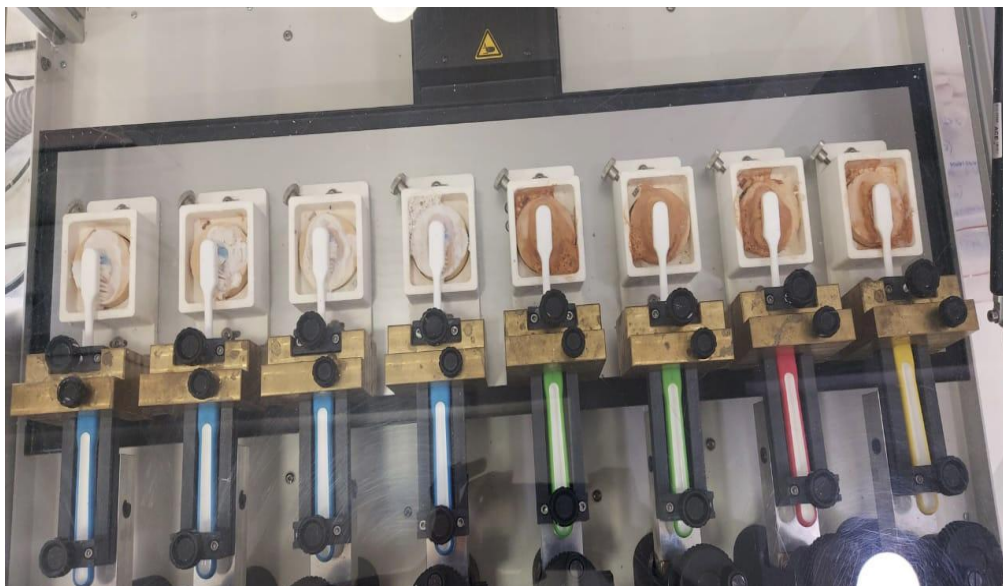
Fig. 2. The image shows the samples placed in the brushing simulator