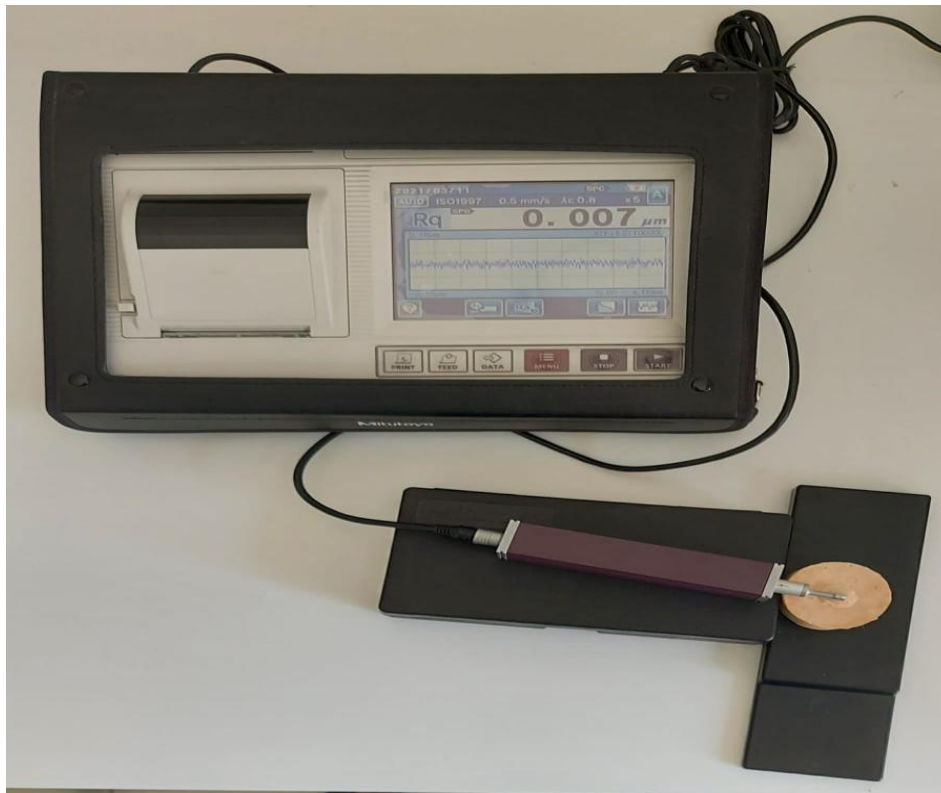
Fig. 3. Represents the stylus profilometer used to obtain the values of surface roughness