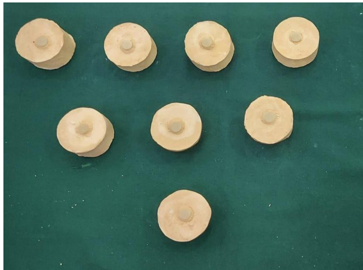
Fig. 1. The image shows the 8 samples prepared using Cention N restorative material

The surface roughness value prior and after performing brushing simulation were obtained and the values were tabulated, with the tabulated values descriptive analysis "Paired t test" was performed using the statistical software "SPSS version 23" and the result of the analysis carried out was depicted in the form of bar graphs.