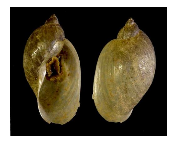
Fig. 2. Lymnaea spp

Msiska; S. Asian J. Parasitol., vol. 7, no. 4, pp. 355-360, 2024; Article no.SAJP.121561