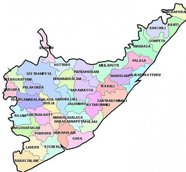
Fig. 1. Srikakulam Block map