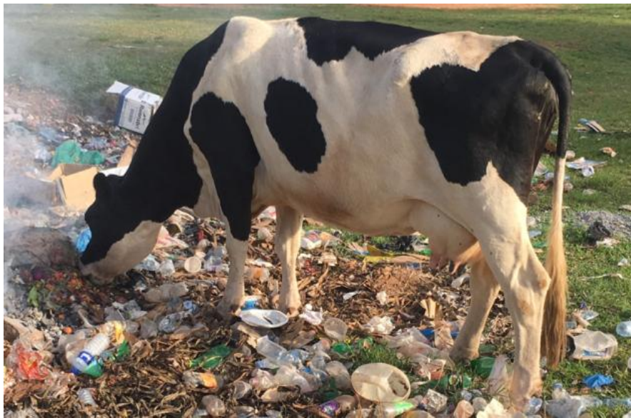
Fig. 4. A cow scavenging for feed from a garbage dump near a grazing area in Kampala