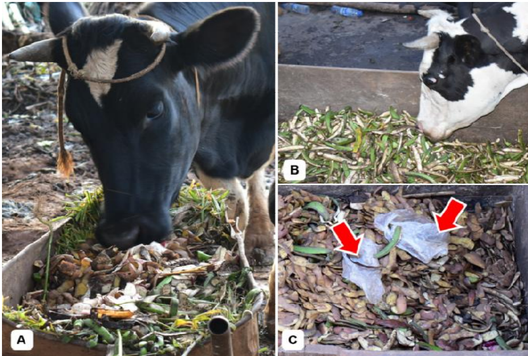
Fig. 3. Crop residues such as banana and potato peels used to feed cattle. The red arrows in Image C show the plastic bags found in the feed trough at one of the farms visited

previous study [1] has shown that non-metallic indigestible materials have the ability to cause ruminal stasis and impaction of the reticulum-abomasum orifice thence impairing digestion.