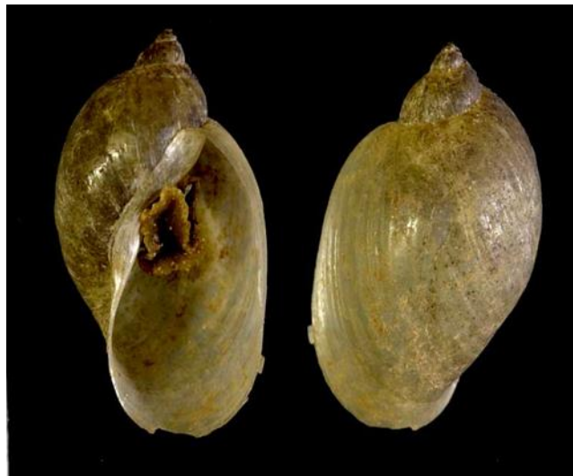
Fig. 2. Lymnaea spp