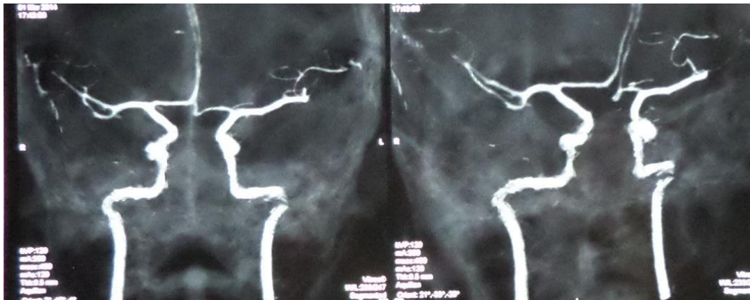
Fig. 2. CT angiography showing a case of aplastic ACoA complex, representing the most common variant of ACoA complex

In our study, we used both DSA and CT angiography to study the anterior communicating artery complex and to detect the anatomical variations. The use of both DSA and CTA gives more accurate results. All the 70 patients have done CTA; only 40 patients have done DSA.